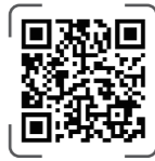
Govee Home App

For FAQs and more information, please visit: www.govee.com